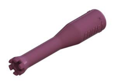
Compression adjustment tool RRS70.9948